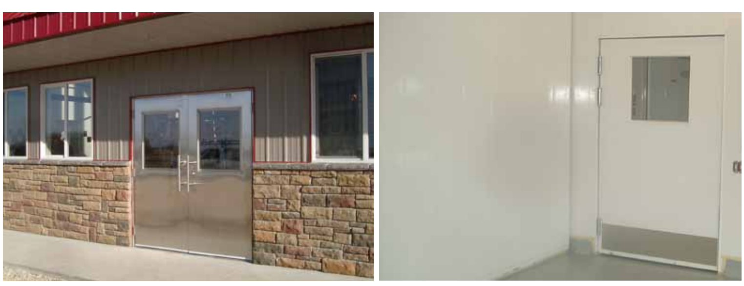
(Exterior Glen-door with stainless-steel finish)